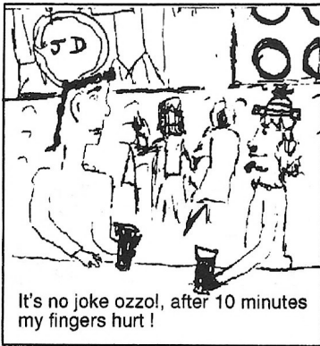
It's no joke ozzol, after 10 minutes my fingers hurt!